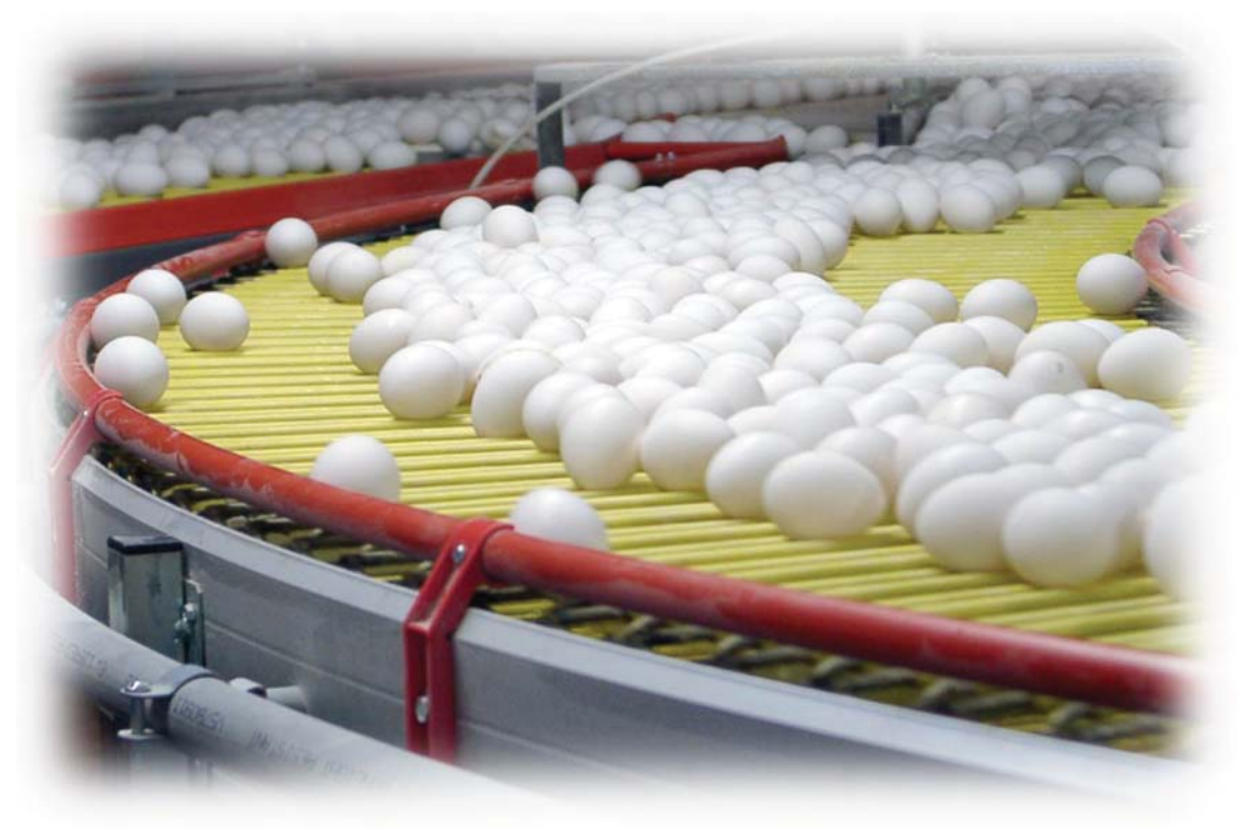
Curve Conveyor for Egg Transport