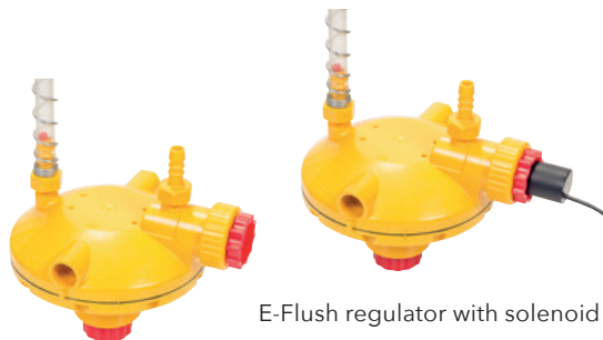
E-Flush regulator with solenoid